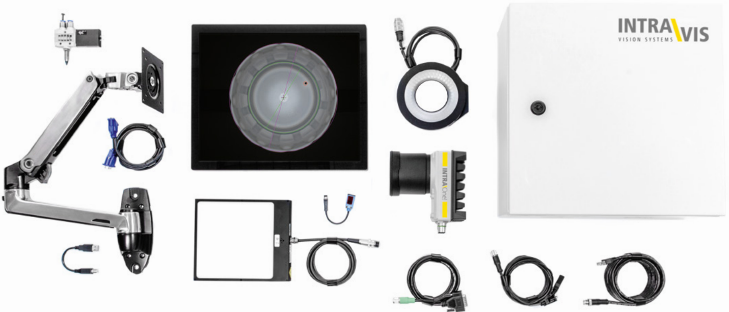
The entire IntraOne!® equipment including the basic package and additional options

Designed as a single-camera-system, the IntraOne!® combines the advantages of a smart camera solution with the well-established IntraVision software. It can be used for the quality control of preforms, closures, bottles, containers as well as labels and decoration.