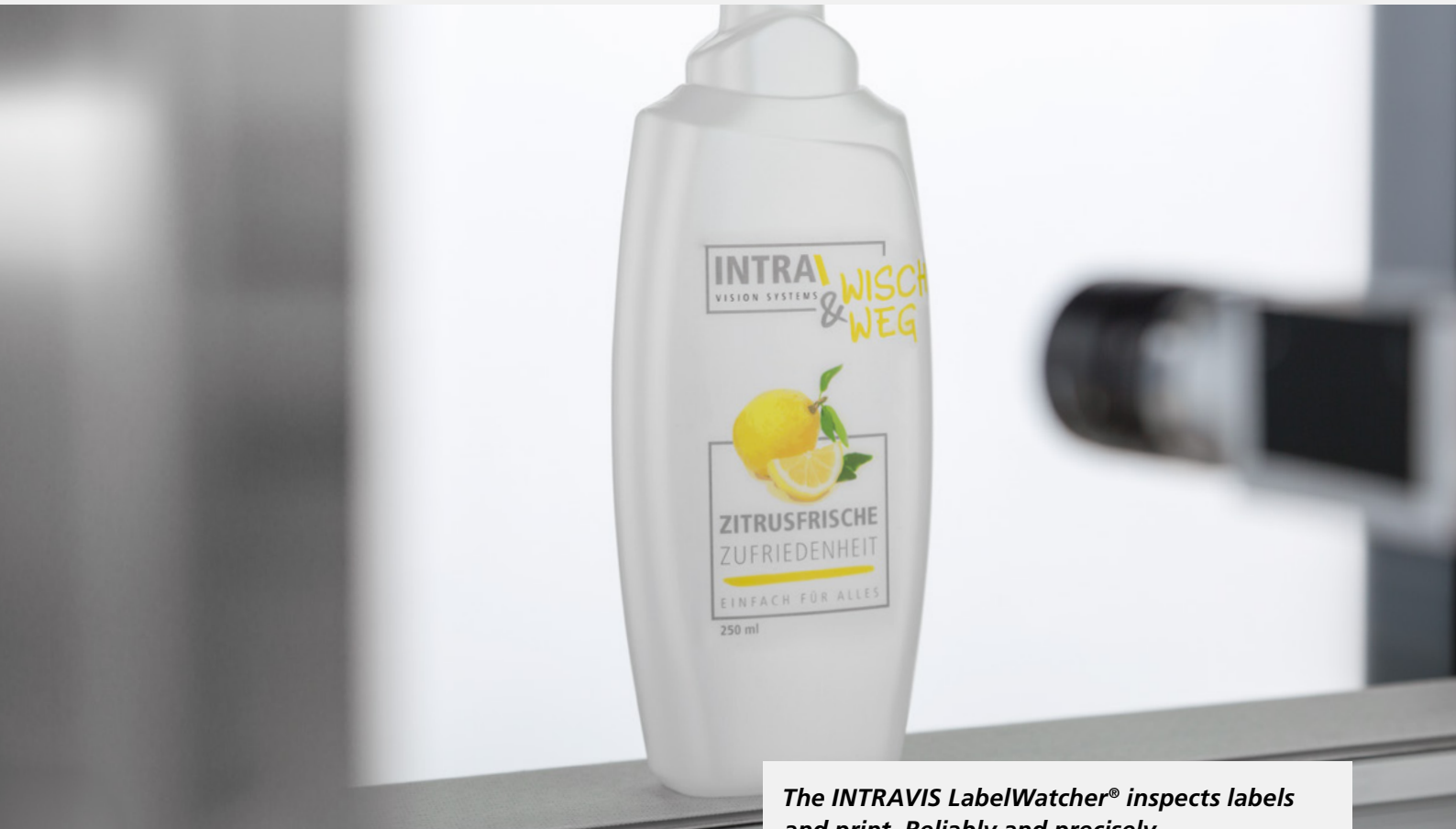
The INTRAVIS LabelWatcher® inspects labels and print. Reliably and precisely

The LabelWatcher® is the universal label inspection system: global players of the plastic packaging industry, such as labelers, fillers and bottle manufacturers as well as closure manufacturers, use the inspection system for the inspection of decorations and appreciate its easy operation.